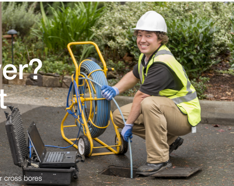
PSE service partner Hydromax USA inspecting for cross bores

In neighborhoods where natural gas was installed without digging trenches, there's a small chance that a gas pipeline was inadvertently inserted through a sewer. Called "cross bores," these gas lines are safe unless damaged. A cutting tool used to clear a blocked sewer is capable of rupturing a cross-bored gas line, allowing gas to enter your home and endanger your safety.